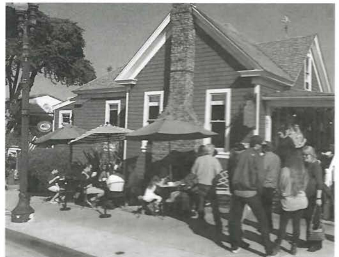
Breakfasters wait outside the Red House Café at Lighthouse and 19th while outdoor diners eat.

Another change has been evident for some time, and that's the proliferation of outdoor dining areas. City restaurants are being allowed to take advantage of the wide sidewalks along Lighthouse Avenue to add outdoor tables and chairs (below), giving the town a Parisian feel. If climate change persists and Pacific Grove becomes a sun-lovers' paradise, this trend will continue. But if our native summer fog returns, we'll see!