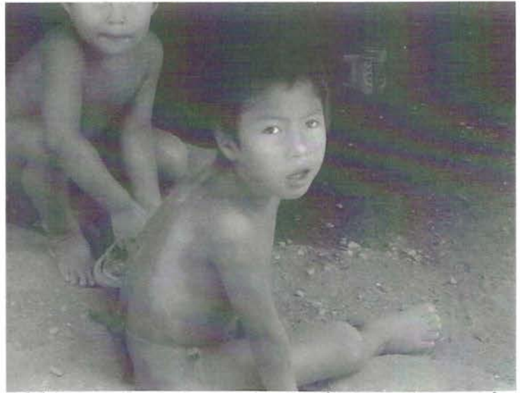
Embera Indian children in Panama.