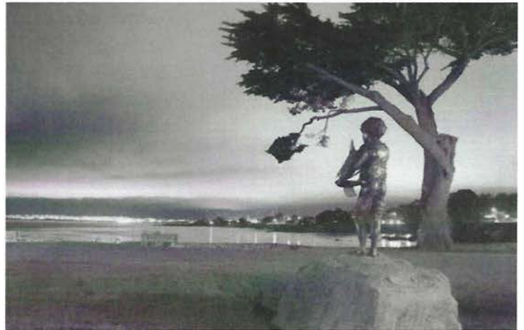
Dorothy Fowler's statue at Lovers Point.

People's memories are always interesting because they reveal what they choose to remember.