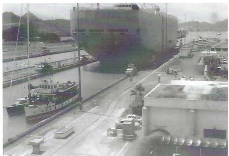
The Panama Canal. 100 years ago completed, and still in operation.