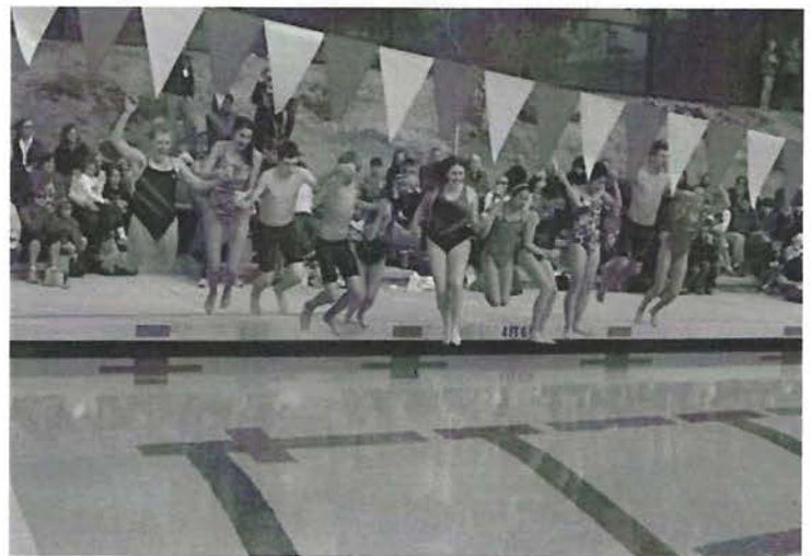
The Breakers Swimming and Diving Team inaugurates the new PG High pool in January.

My class of 1973 entered PG High the first semester the old pool was open. How well we remember those 8:00 a.m. P.E. classes, and having to get undressed, into a swimsuit, and out into the water in the fog while our gym teacher Mrs.