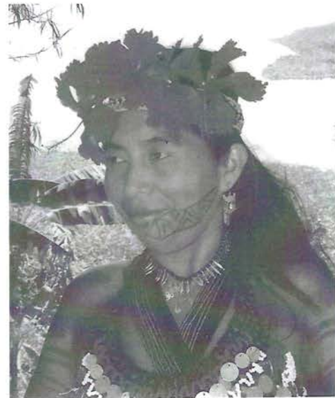
An Embera Indian woman with facial tattoos.