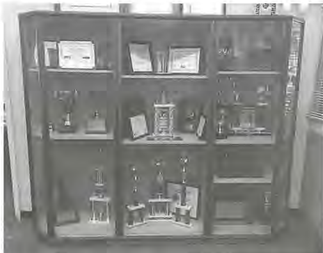
The PGHS Trophy Case.