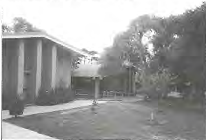
Pacific Grove High School.

Pacific Grove High School is among the 275 middle and high schools in California that have been chosen to receive a Gold Ribbon Schools Award. The only other school in Monterey County to receive this award is Salinas High.