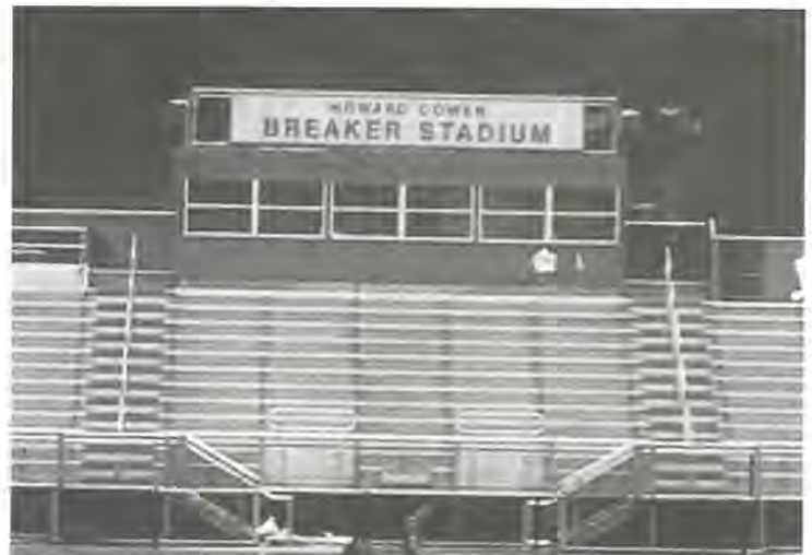
The Howard Cowen Breaker Stadium, Photo by Beth Penney.