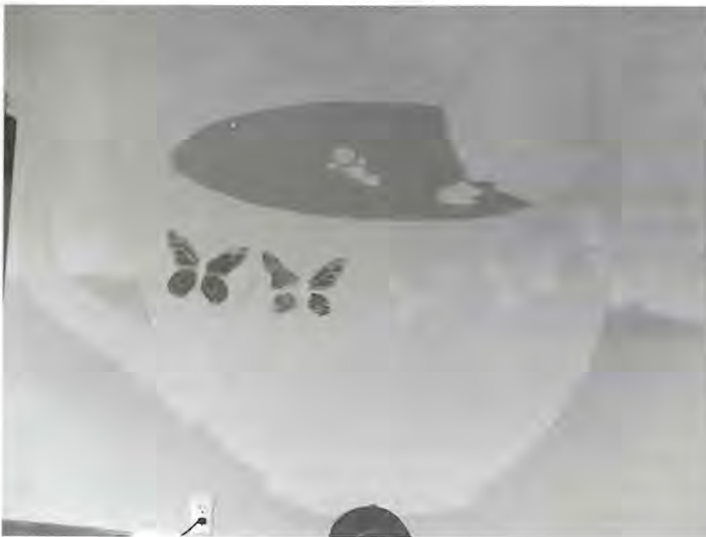
A unfinished butterfly-rimmed coffee cup adorns the left side of the wall in the Beach House Café. More butterflies are sketched in, flying skyward to the right, unseen in this photo.

This article appeared originally in the Monterey Herald, May 17, 2017. Reprinted with permission.