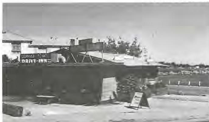
Postcard image of the old Lovers Point Drive-Inn, with Borg's Motel in the background.